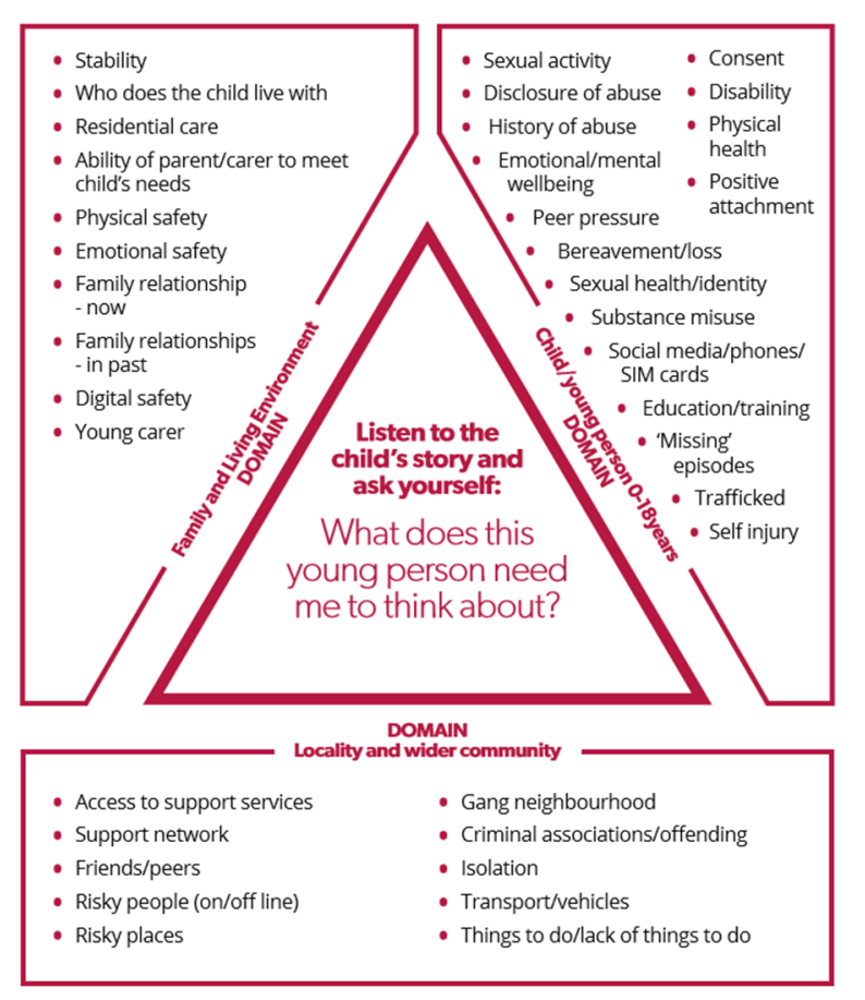
(Diagram taken from Buckingham LSCB Child Exploitation Indicator Tool)